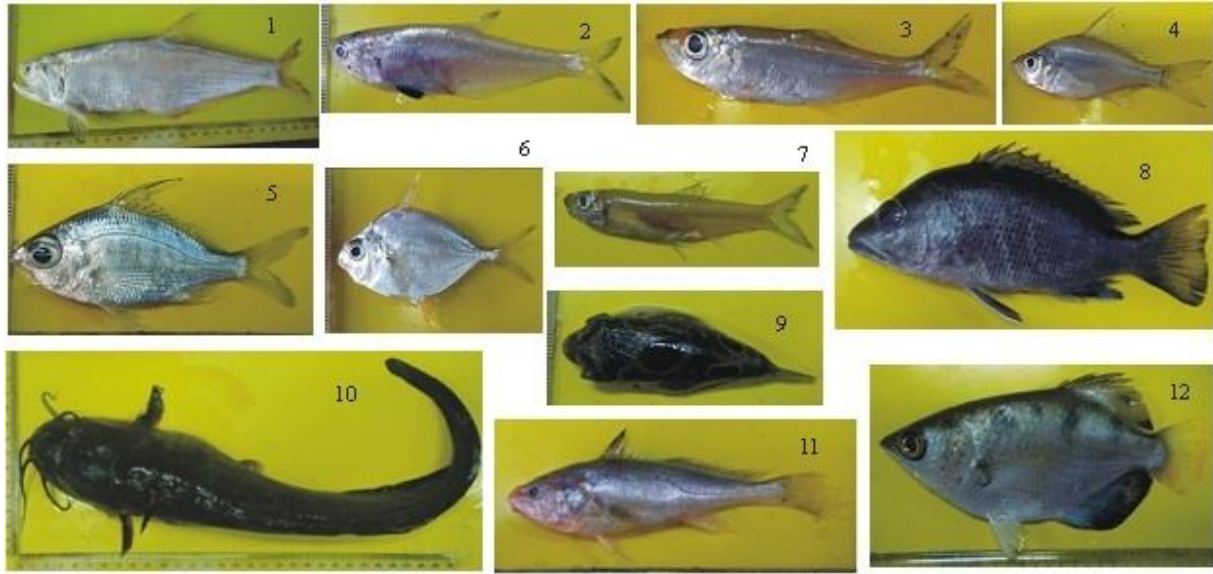
Figure 3. Some of the marine fish species found in Mahakam river and its floodplain, East Kalimantan of Indonesia : 1) Lampa (Bareback anchovy, Papuaengraulis micropinna ), 2) Bulu Ayam (Long fin anchovy, Setipinna tenuifilis , 3) Puput (Ditchelee, Pellona ditchela ), 4) Kaca (Sailfin perchlet, Ambassis interruptus ), 5) Kapas (Whipfin silver-biddy, Gerres filamentosus ), 6) Pepetek (Ponyfish, Leiognathus equulus ), 7) Teri (Indian anchovy, Stolephorus imdicus ), 8) Kakap (Black bass, Lutjanus bohar ), 9) Buntal (Puffer, Tetraodon sp ), 10) Sembilang (catfish, Paraplotosus albilabris ), 11) Gulamah (Croaker, Nibea sp ), 12) Sumpit (Archerfish, Toxotes jaculatrix ).