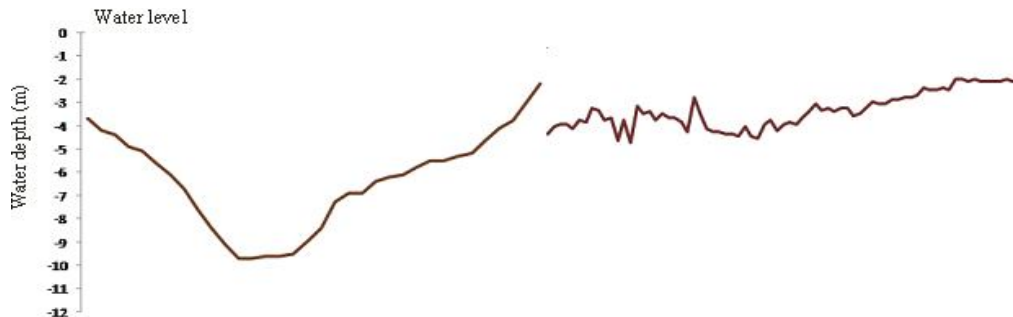
Figure 2. The comparison of water depth and bottom profile of the two locations (river, left and its floodplain, right) where fish samplings were performed.

Notes : *District of Kutai Timur (East), **district of Kutai Barat (West), others are district of Kutai Kartanegara and city of Samarinda, nd (not detected).